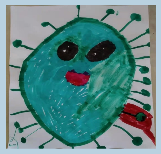
A 5-year-old boy, China